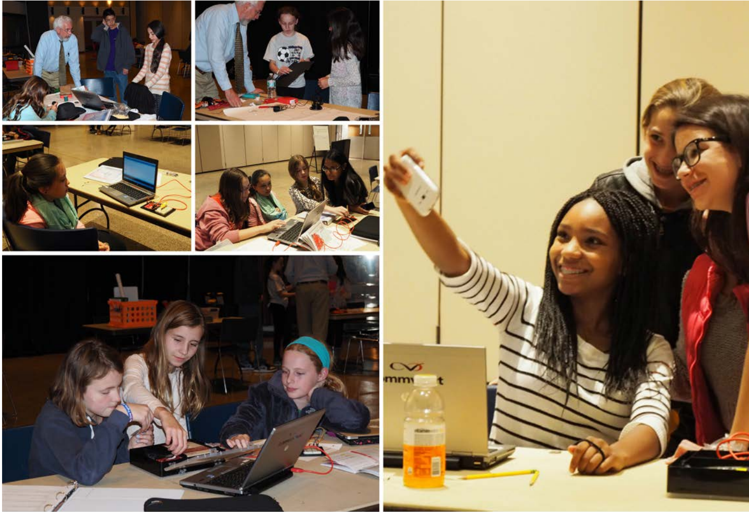
Despite the name, "selfies" always seemed to include more than just one girl.