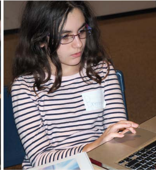
First night introductory experiences - some veterans / some novices...