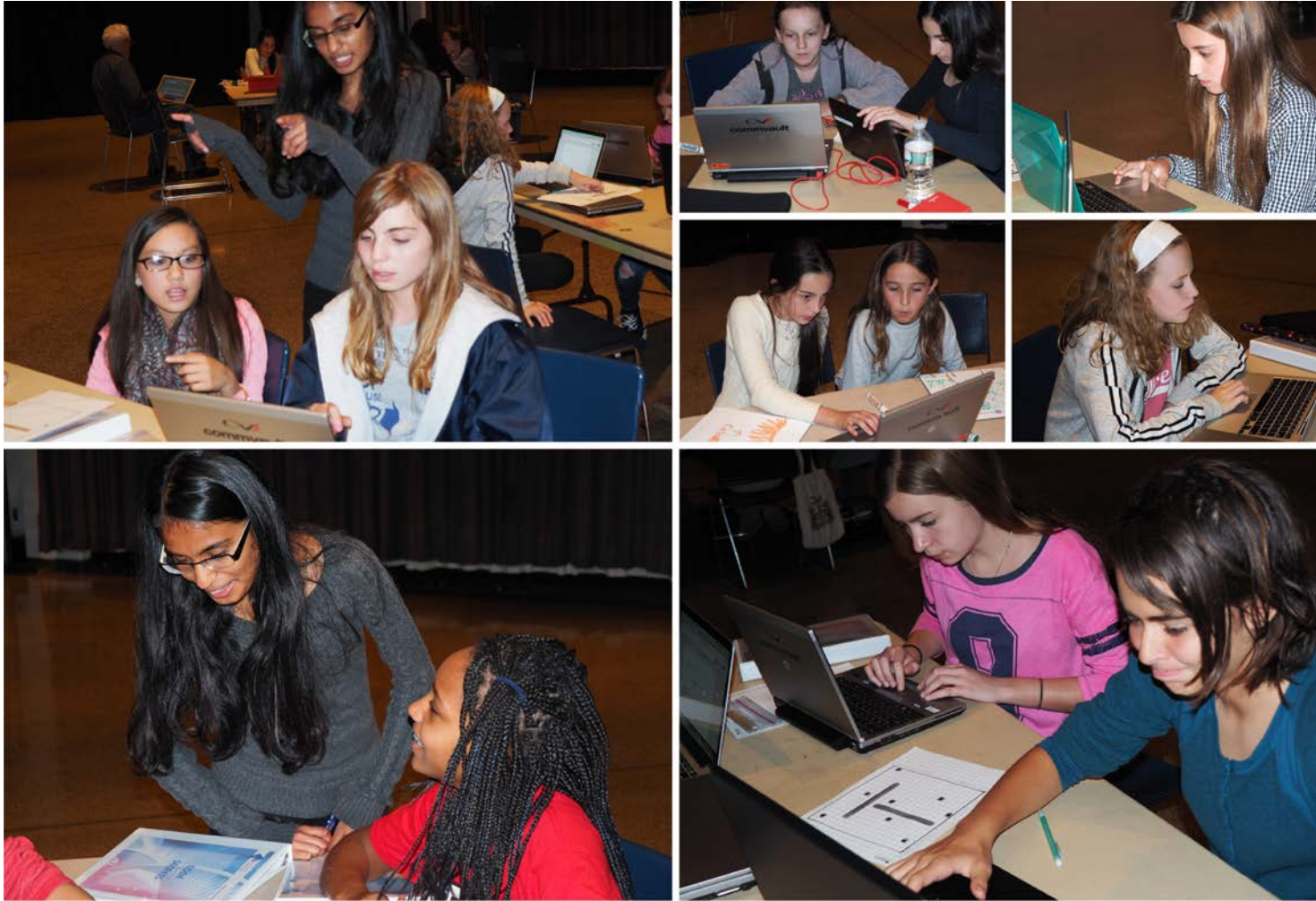
Early activities range in complexity from the Googly Eyes challenge to debugging Arduino sketches.