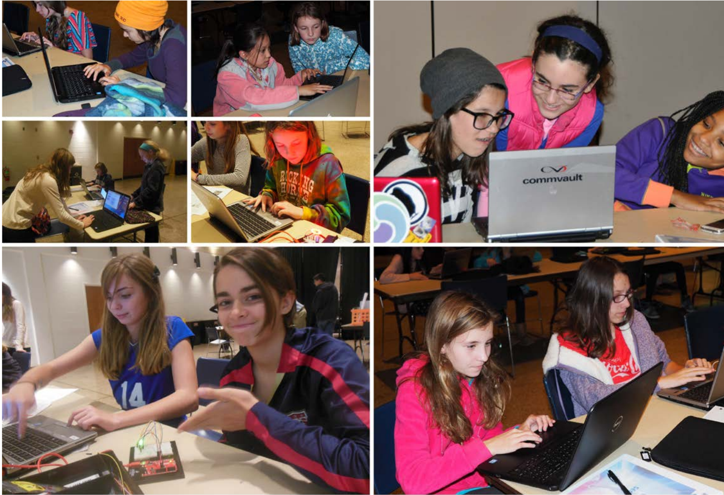
Saylor's choice of tie-dye attire was perfect for the creative patterns she coded on the neopixel rings!