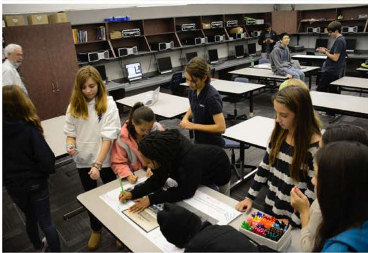
HTHS programming students hosted the girls at a showcase featuring Twitter, Python & Android App Inventor.