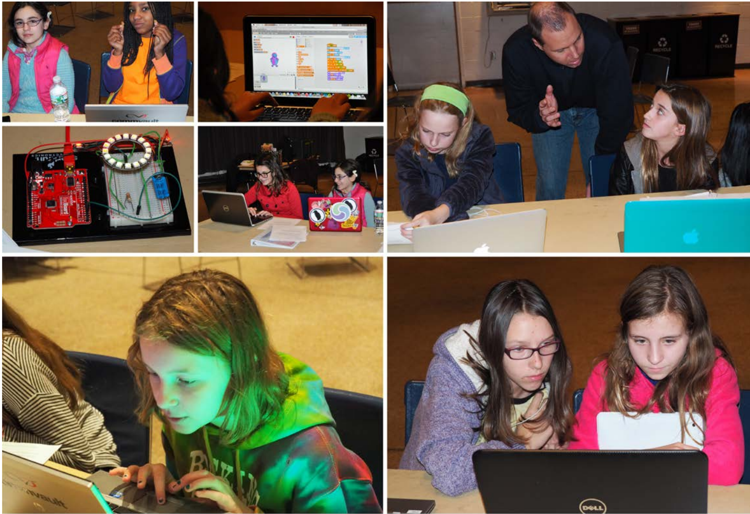
Girls use MIT's Scratch platform to advance their block programming skill set.