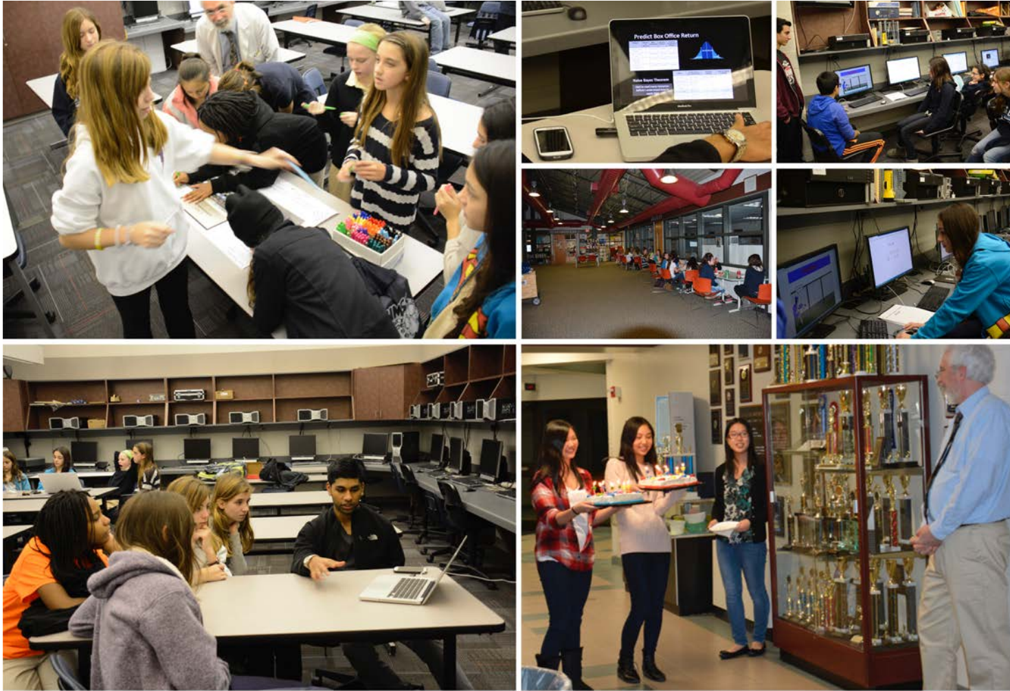
Our grateful girls posed and prepared a personalized thank you for CommVault.