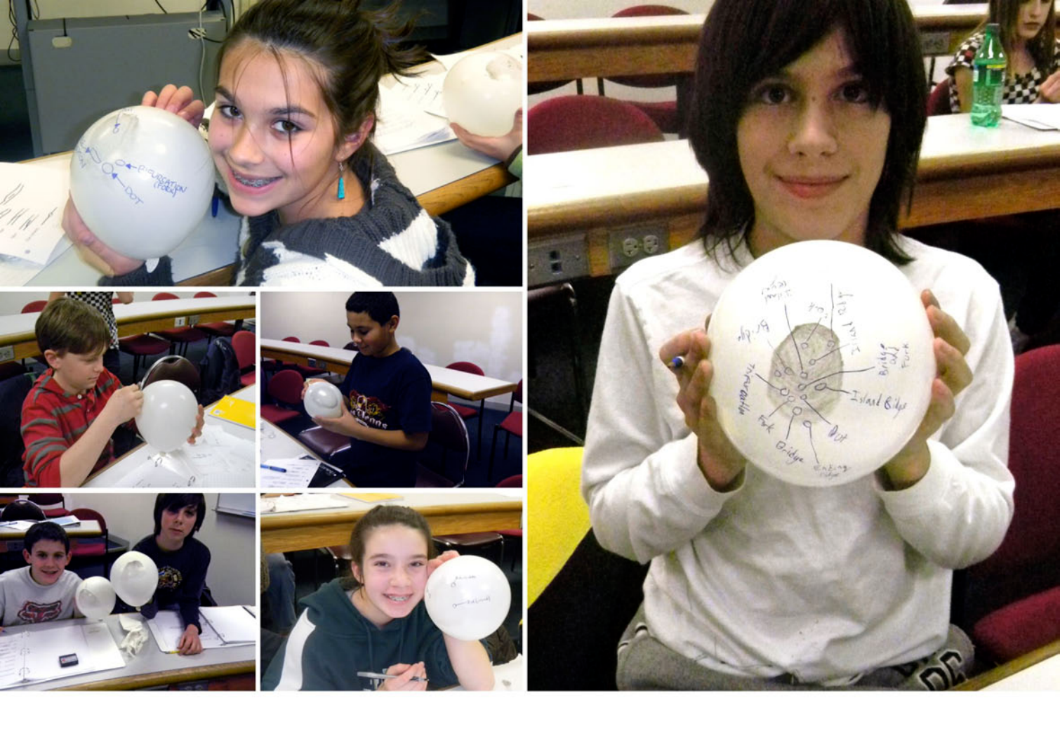
We practiced identifying our own fingerprint ridges.