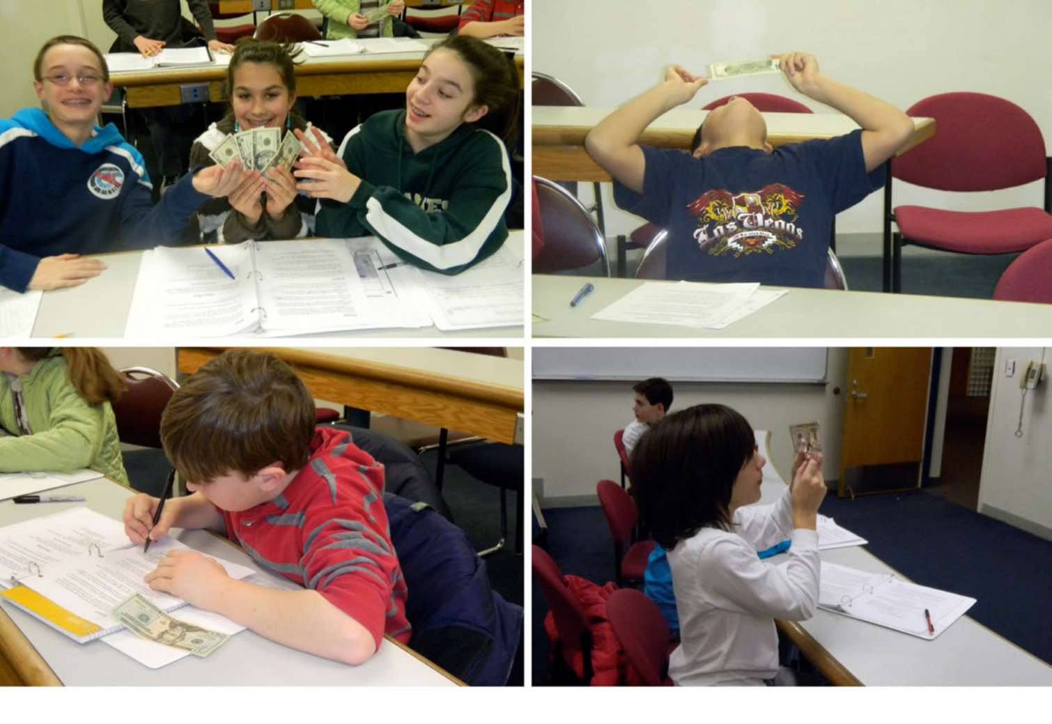
We examined our own currency for security features.