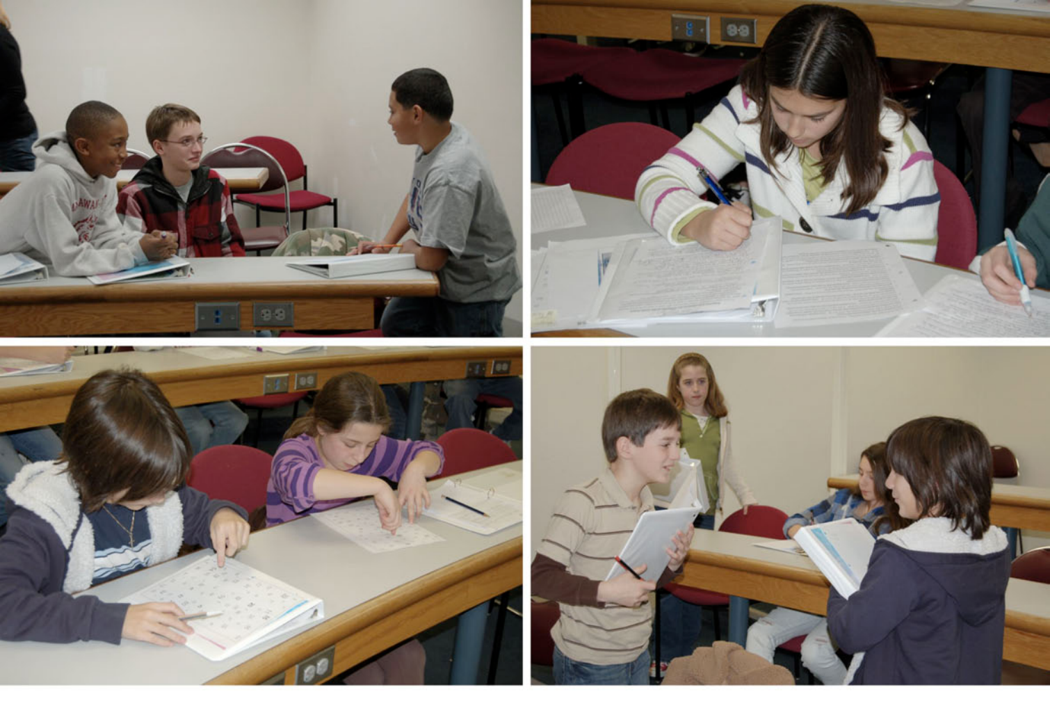
Learn how to narrow down the suspects using the process of elimination?