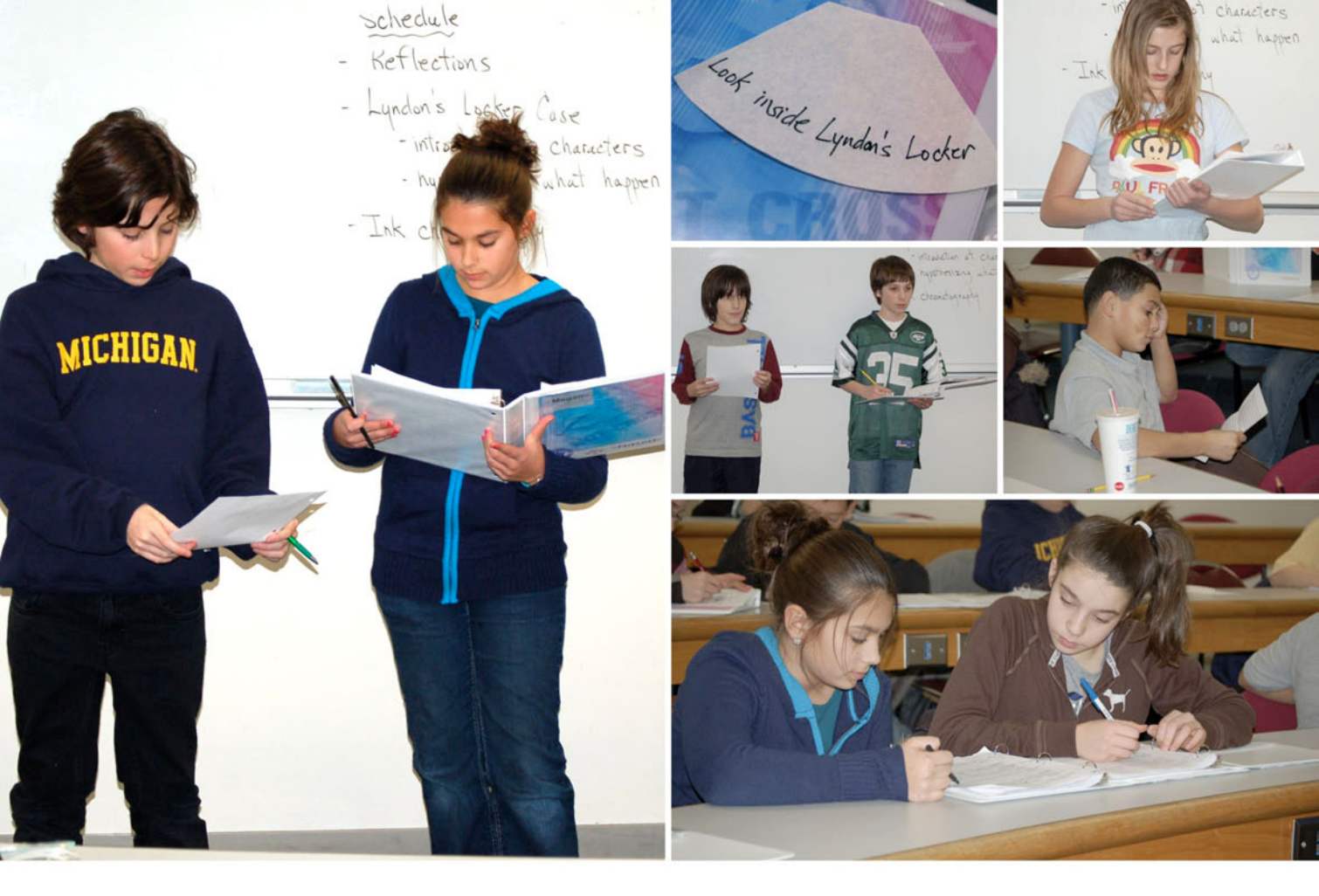
We presented our first thoughts about the possible suspects and motives in the Lyndon's Locker case.