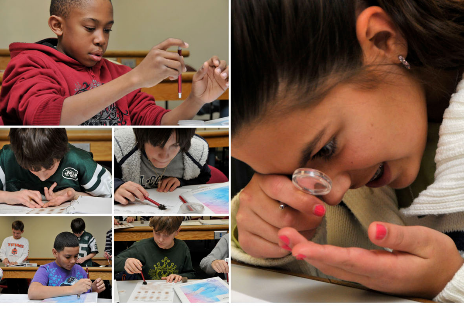
So many more details can be detected as we look closer.