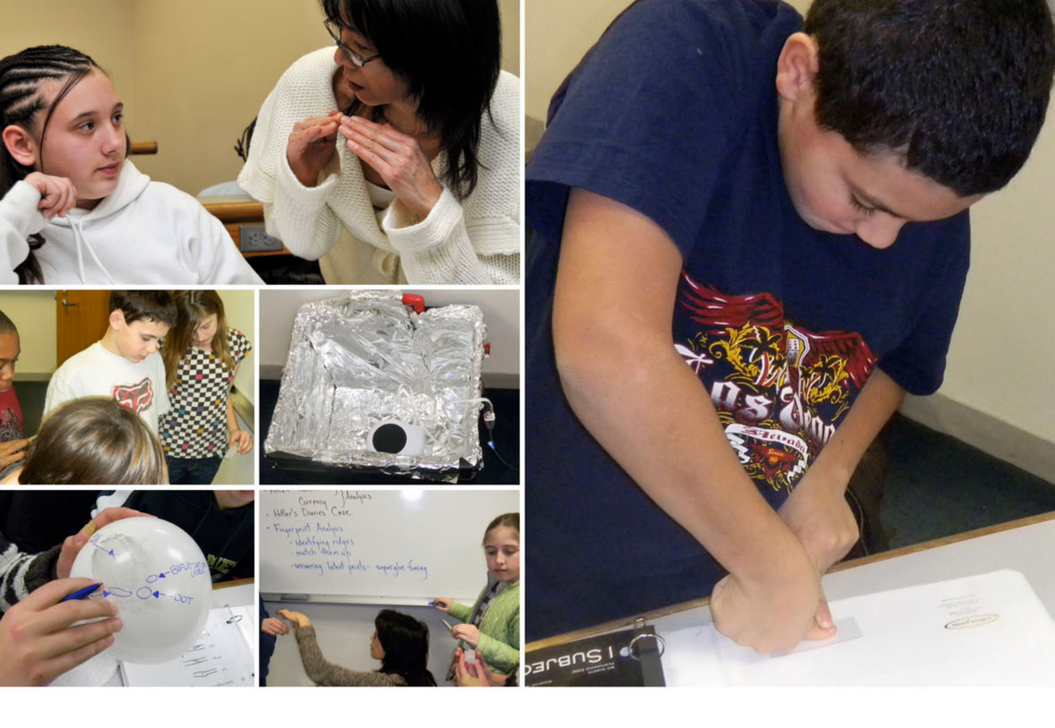
We used super glue fuming to reveal latent prints.