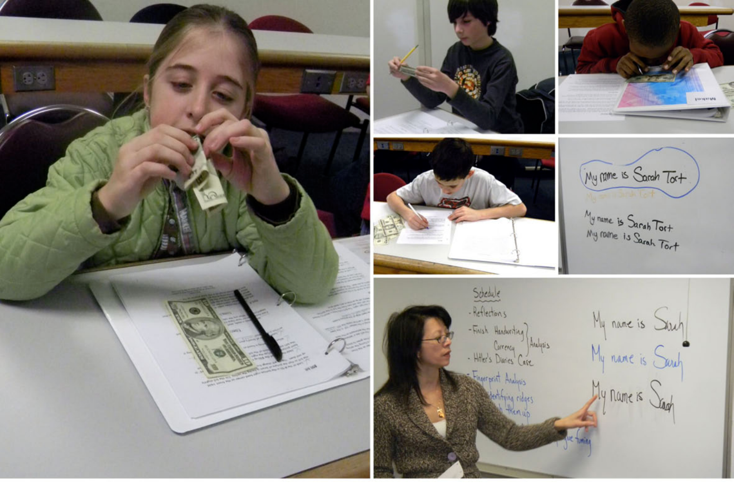
Examining the characteristics in our handwriting.