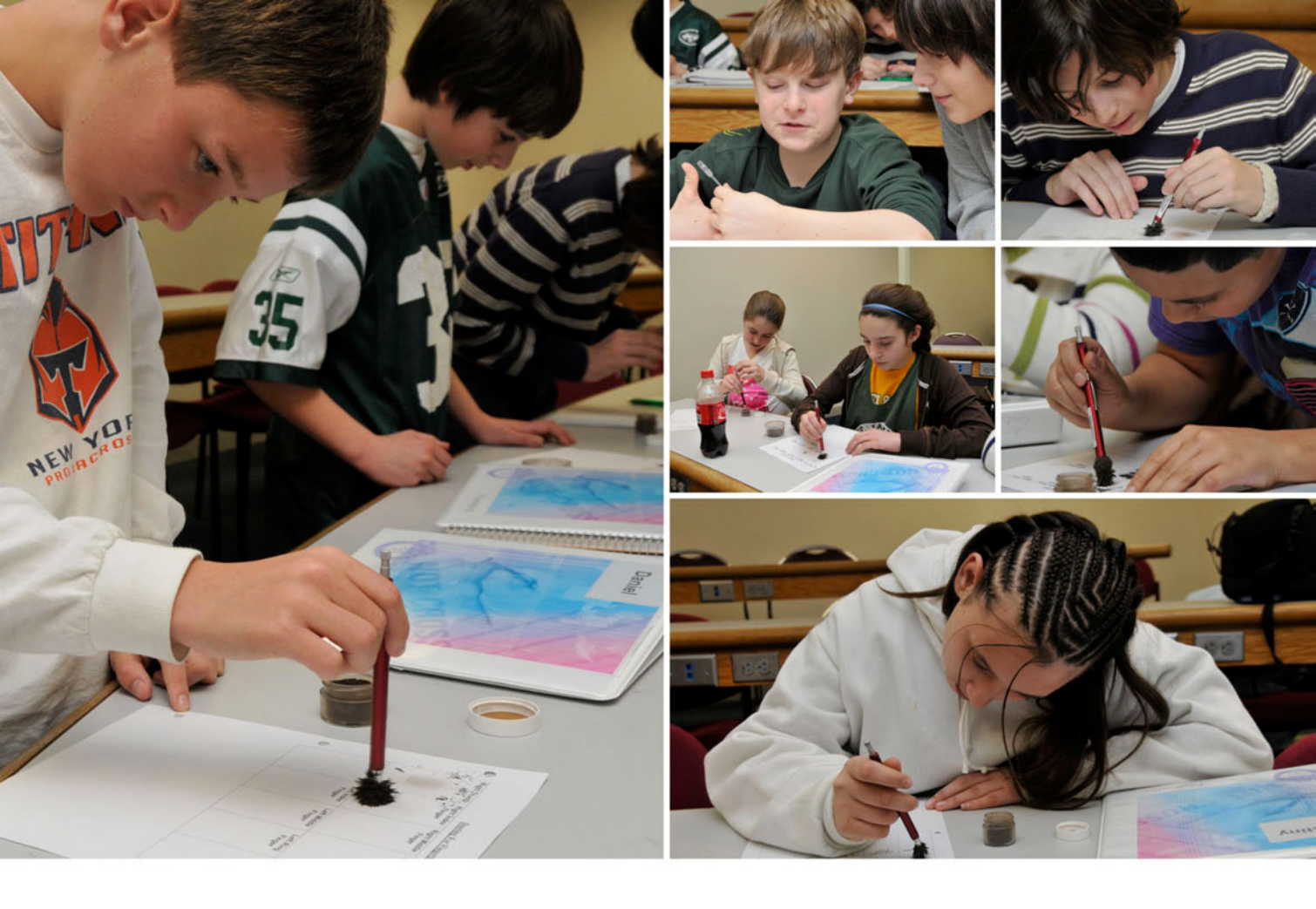
We also practiced using magnetic powder to uncover our own fingerprints.