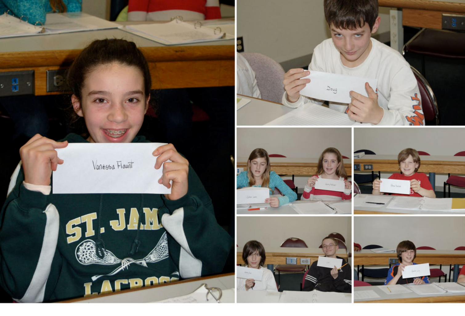
After taking on character roles, we worked to solve the case of the Missing Computer Chip.