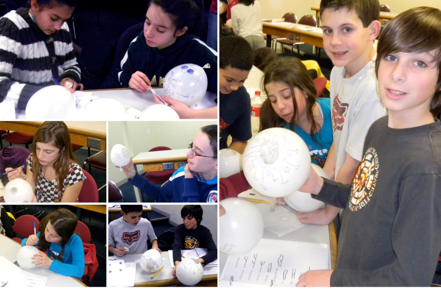
Looking closely at our thumb prints.