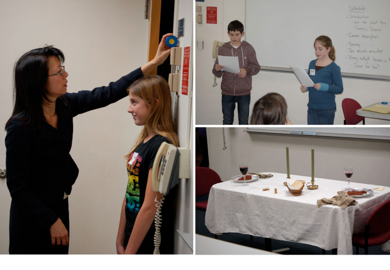
How observant are you?