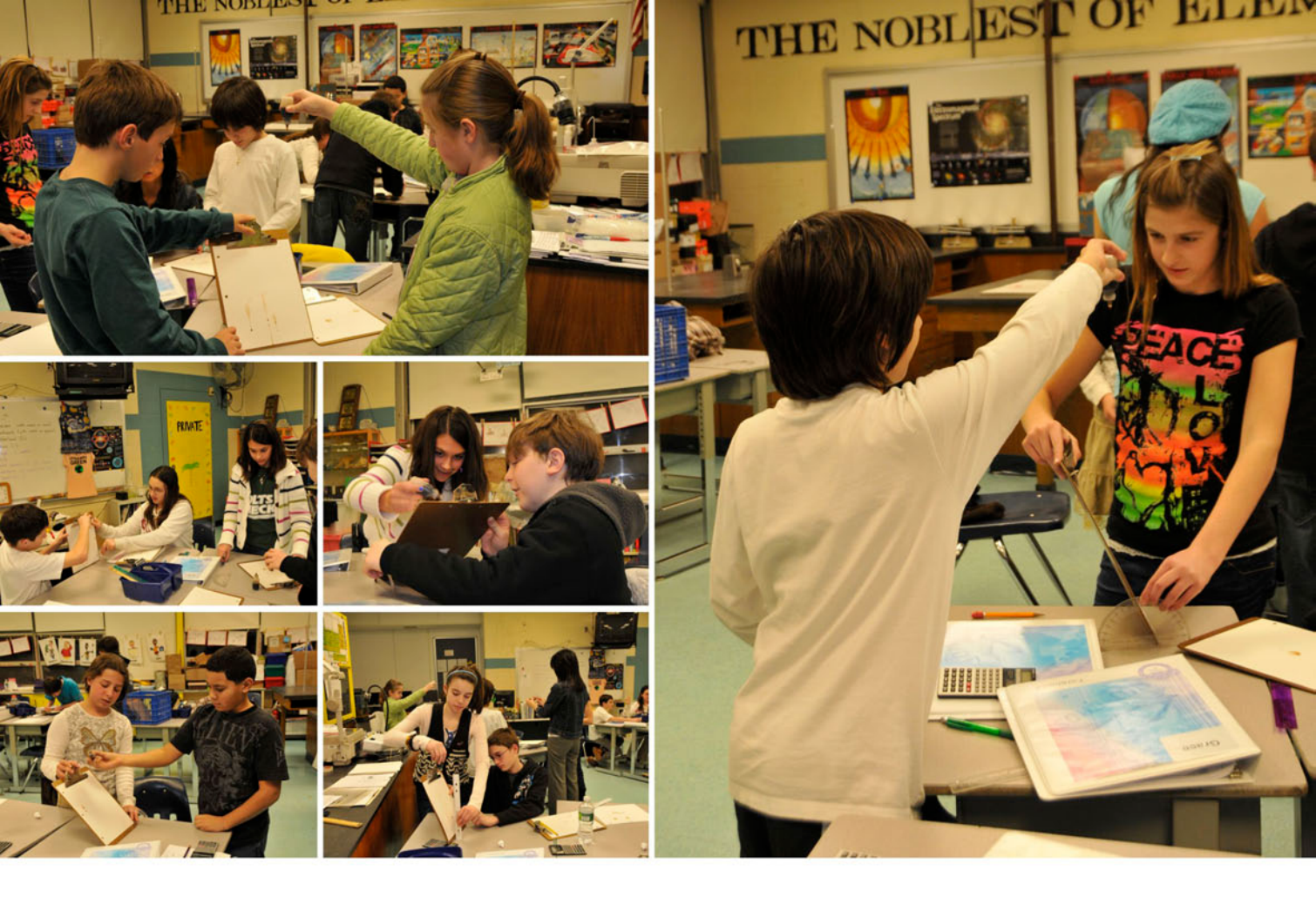
We analyzed the angle of trajectory in blood splatter.