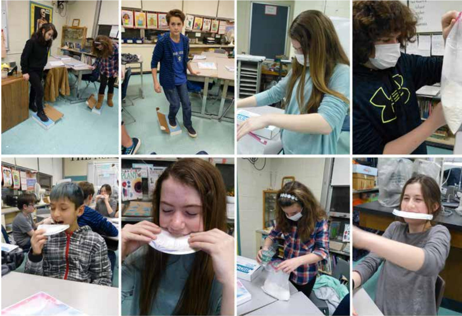
Everyone's shoe impression and bite impression were quite unique...and fun to make.