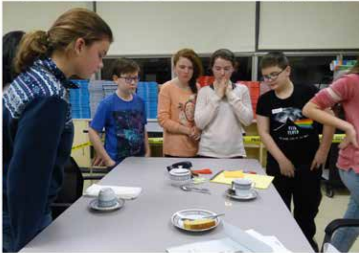
We opened our forensics course with our first case, "What Happened to Dr. X?"