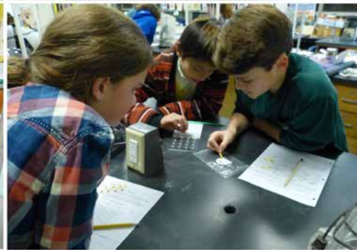
We tested the pH of soil samples collected in Dr. X's case.