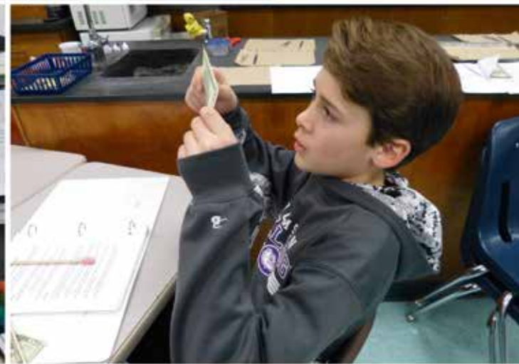
We examined security features in our currency.