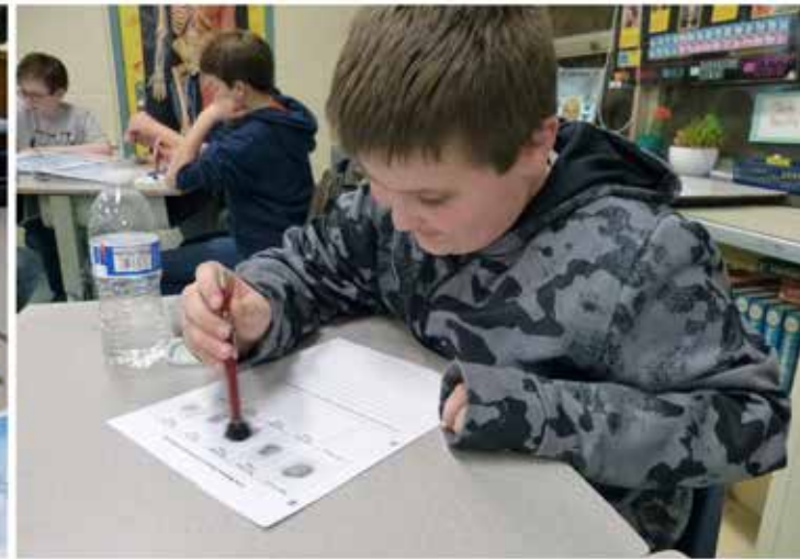
Latent prints were easily revealed after we dusted with magnetic powder.