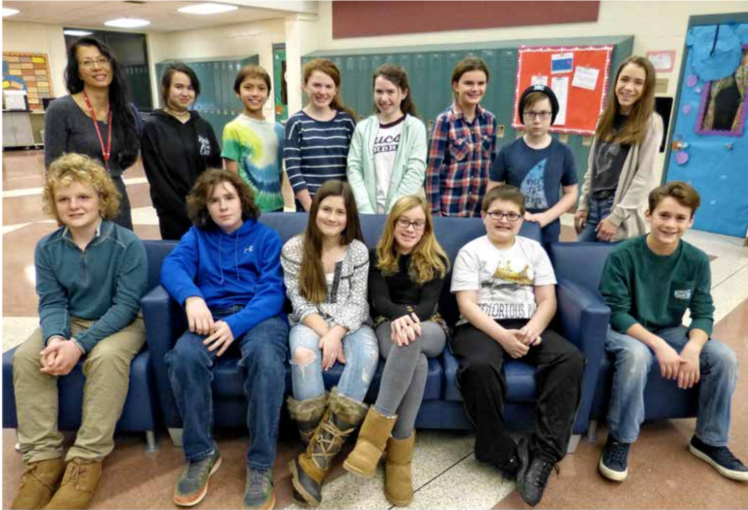
Our 2017 forensics team.