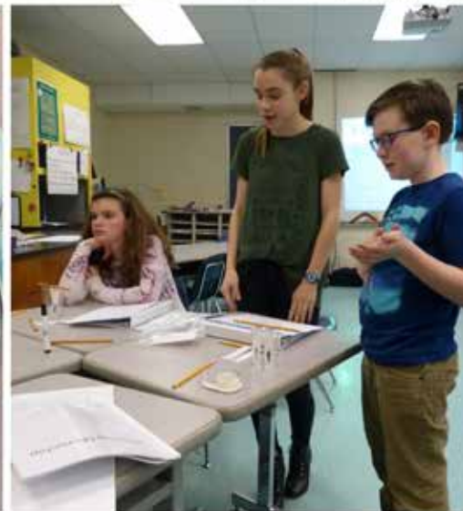
We used ink chromatography to identify the person responsible for leaving the note in the principal's office.