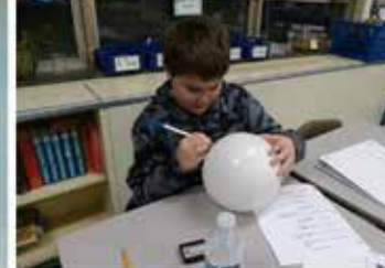
To help us prepare for future cases, we learned how to identify ridges in a fingerprint. The "Matching Fingerprints" challenge was not easy for some of us.