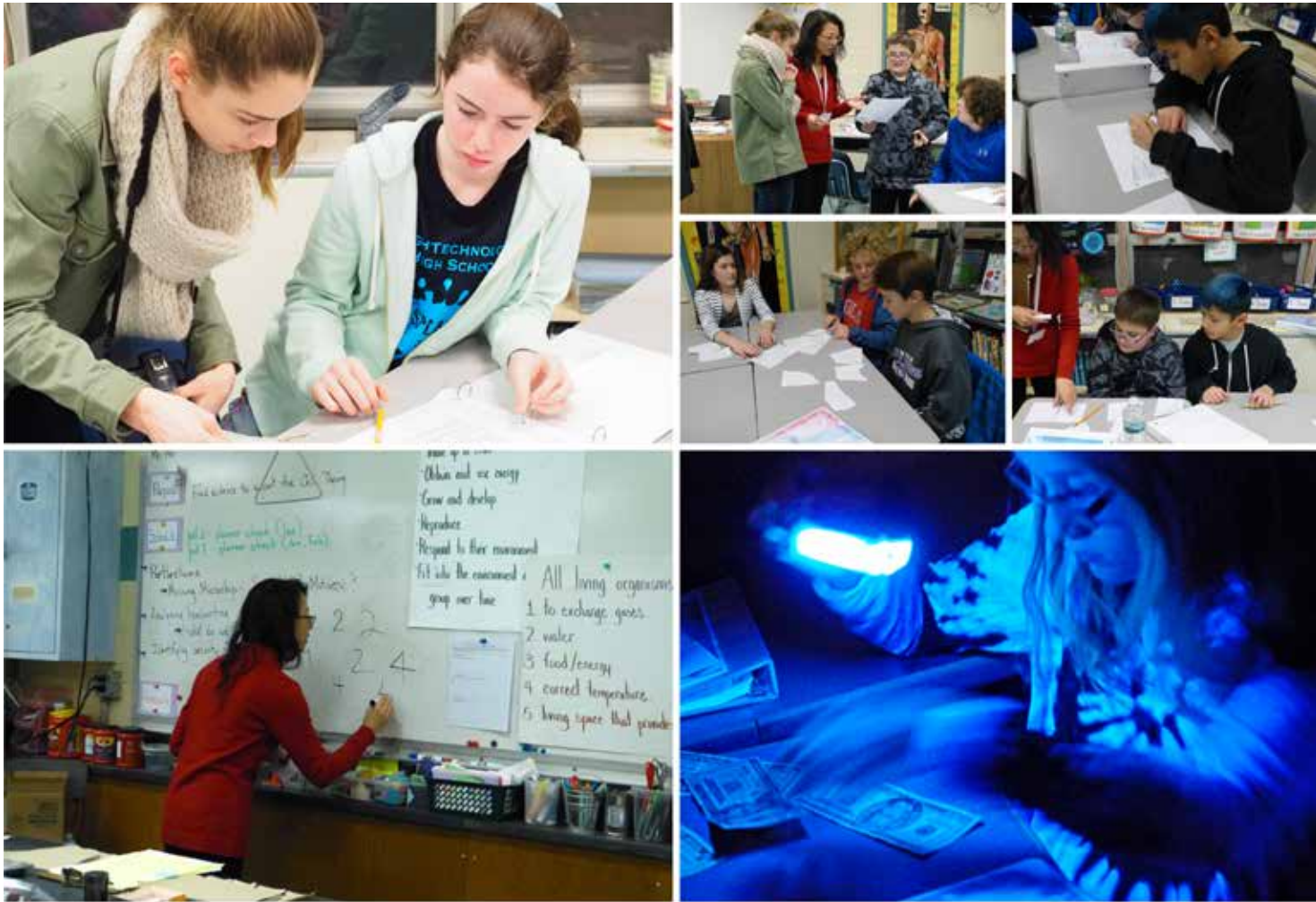
In our fifth session, we focused on forgery and compared our own handwriting.