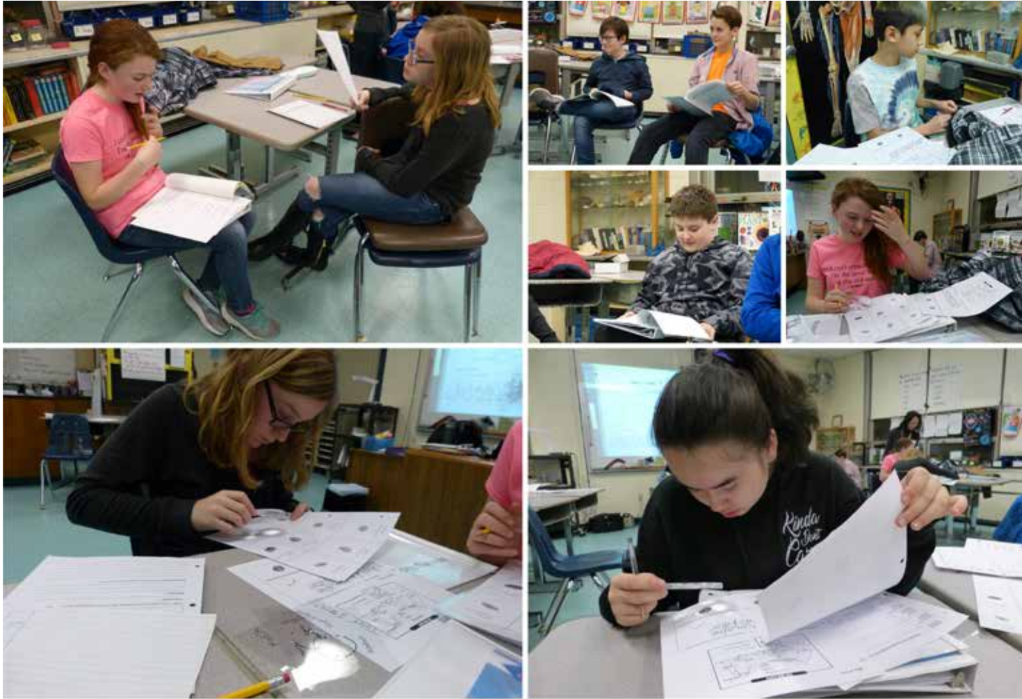
To help us solve "Sissy's Kidnapping," we reviewed interviews and examined fingerprints to find a match.