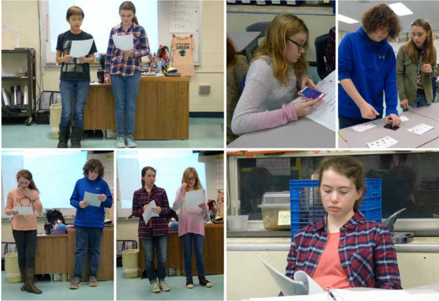
Each team worked hard at reconstructing the crime that took place at Plum Computer Company.