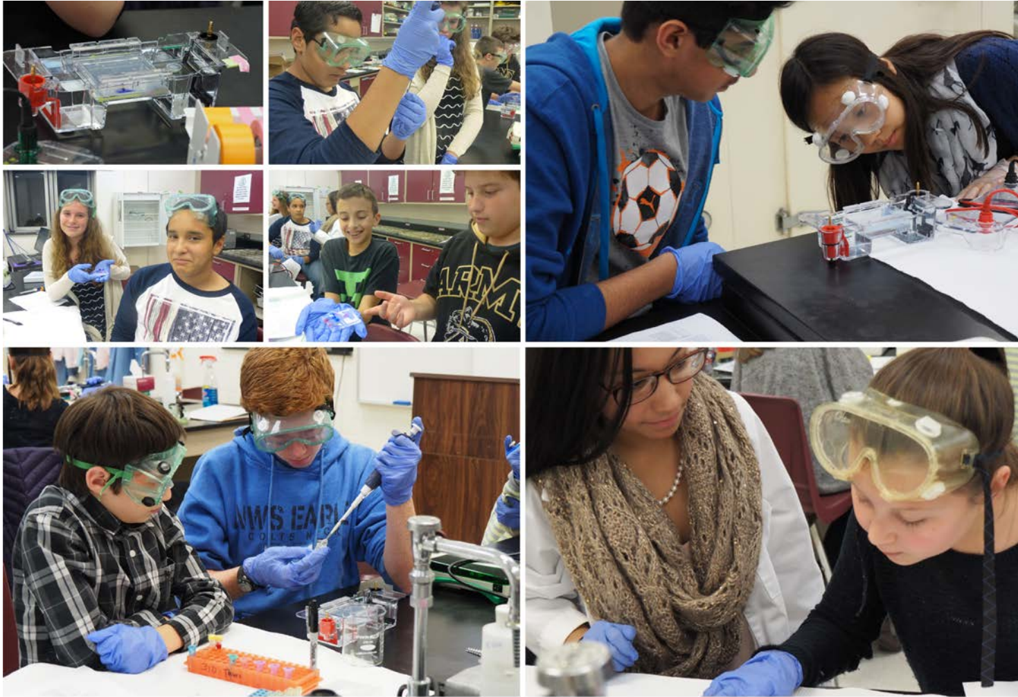
Our journey next took us to the land of gel electrophoresis!