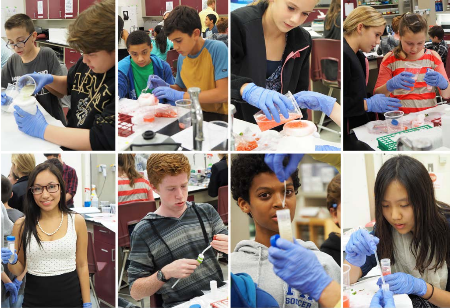
Upon learning about DNA, we made candy models of the double helix. But it was more exciting to extract DNA from bananas and strawberries.