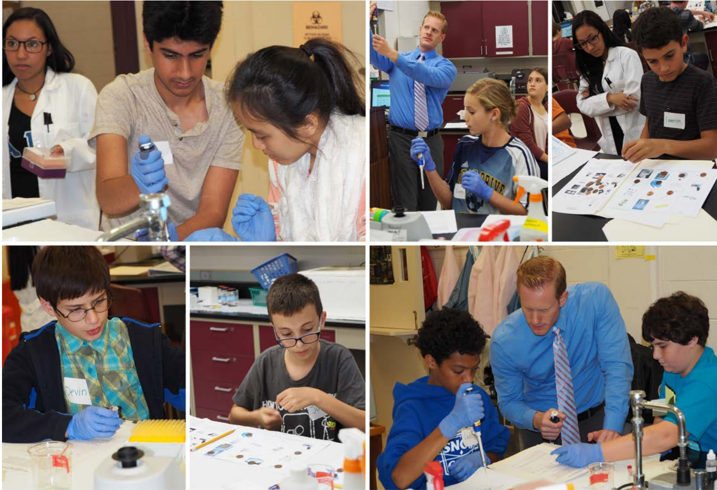
Our exploration of biotechnology began with identifying lab equipment that we would be using throughout the course, with a focus and emphasis on the proper use of the micropipette.