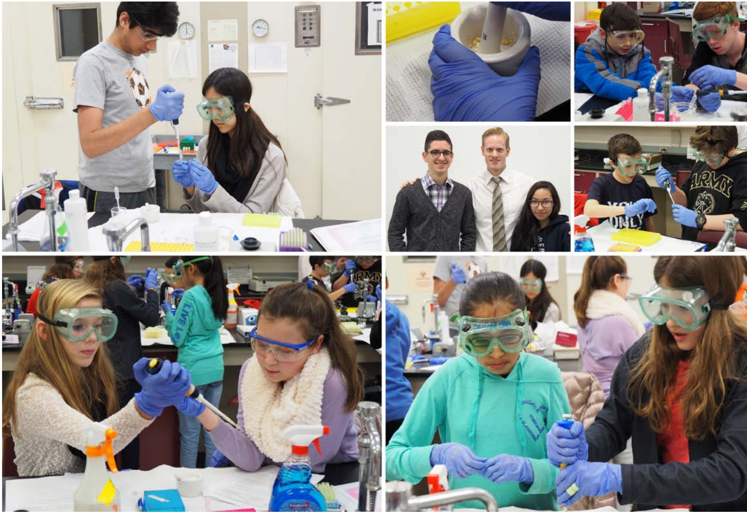
The first night we extracted DNA and then replicated it in the thermal cycler using PCR. The last class used gel electrophoresis to determine if any of our foods contain GMOs!