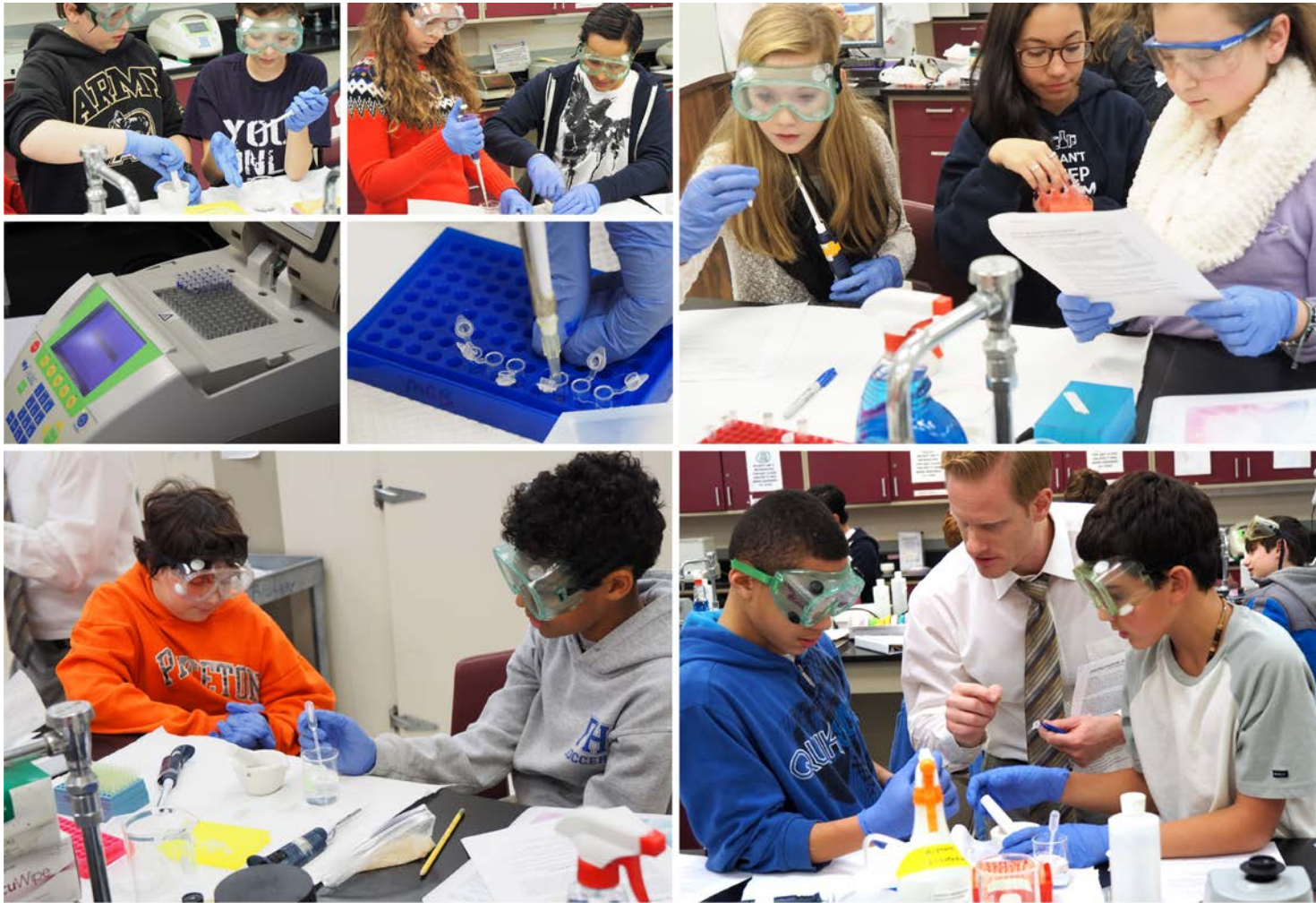
Our final capstone experiment rolls many of our laboratory techniques into one large experiment. Using foods that we brought in, we are testing to see if any contain genetically modified ingredients!