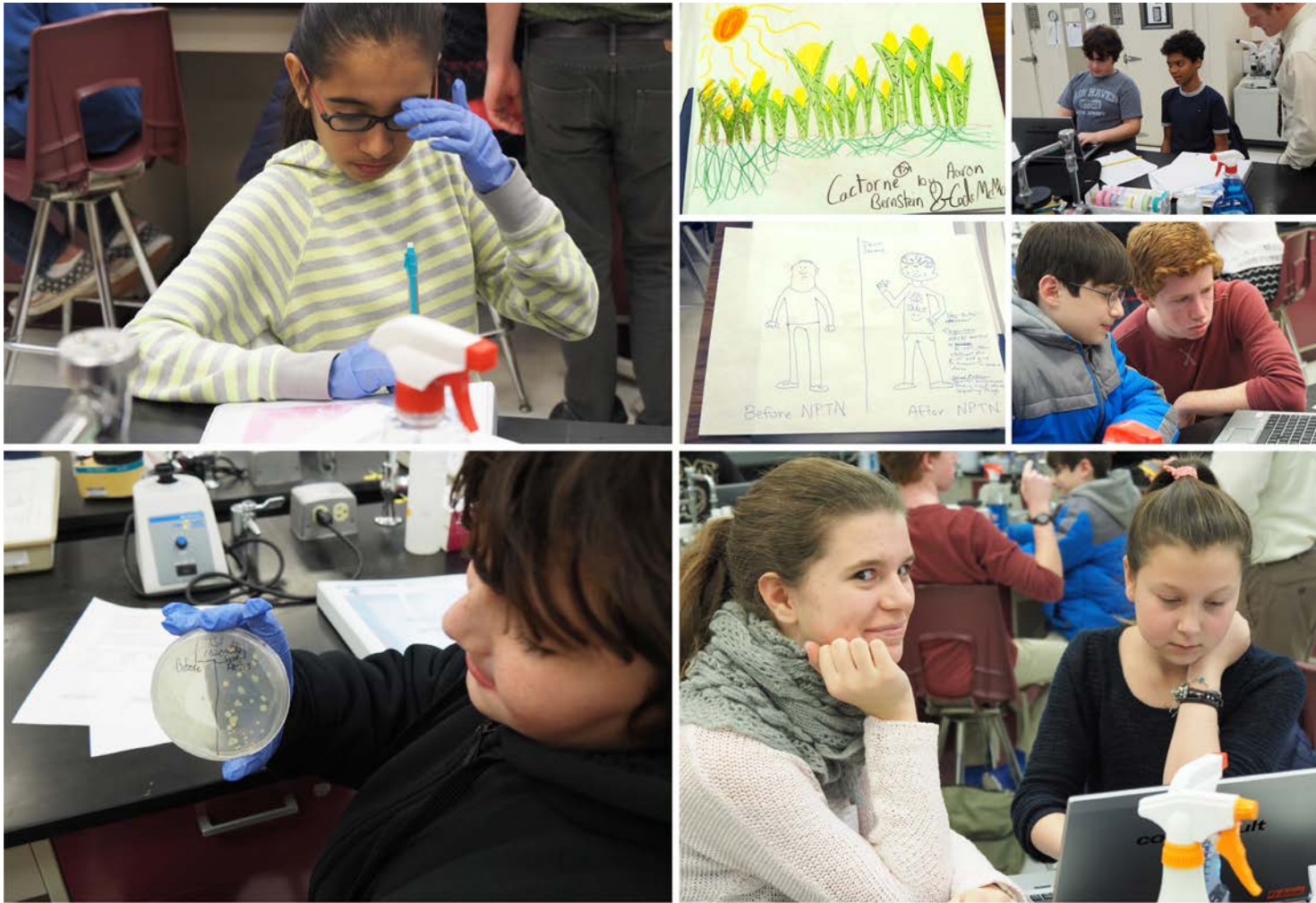
After successfully genetically engineering bacteria, we came up with our own ideas of genetically modified organisms (GMOs) that would help solve a problem.