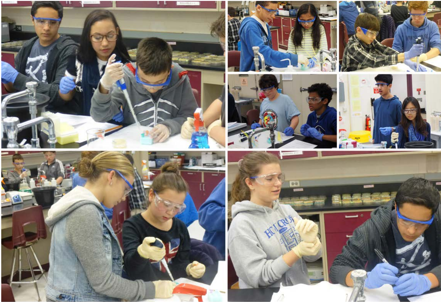
We kept on using that micropipette for nearly every lab!