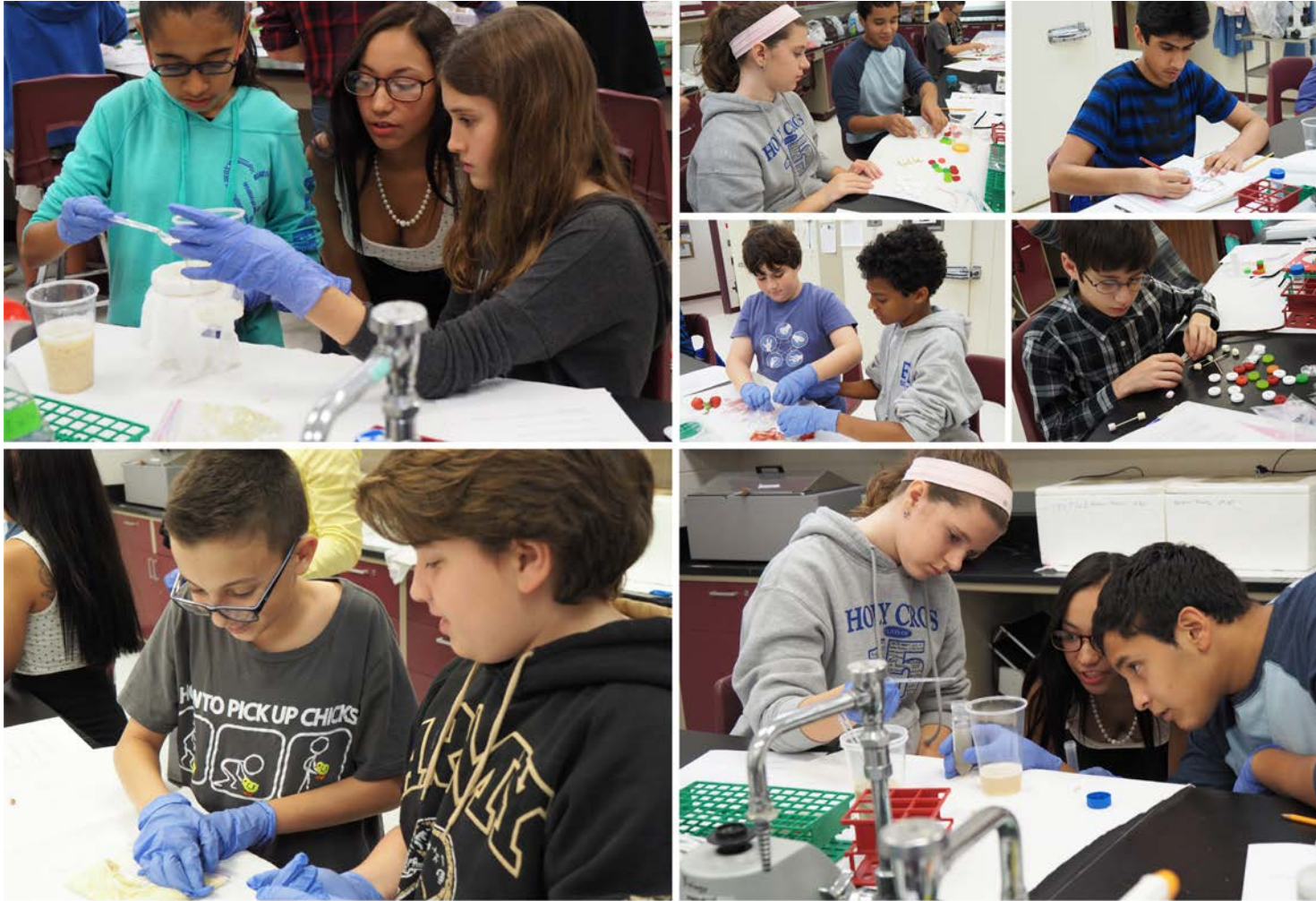
With some time and patience, nearly everyone extracted some DNA!