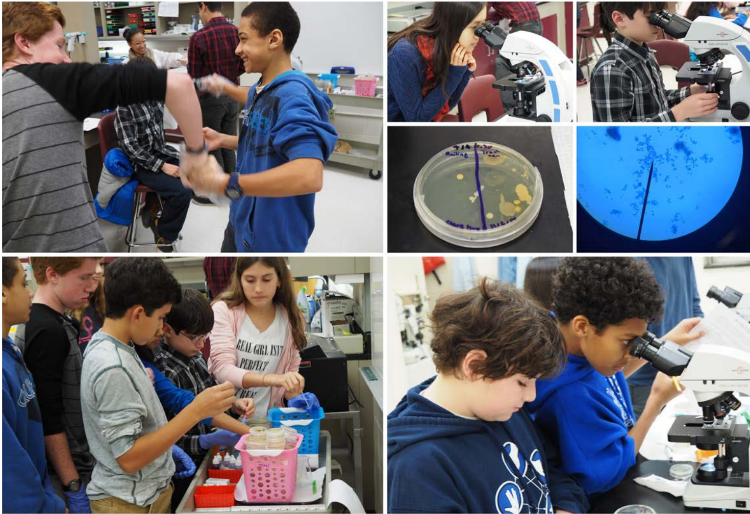
We were then able to look at some bacteria under the microscope and see what we cultured. We also explored epidemiology and how diseases spread.