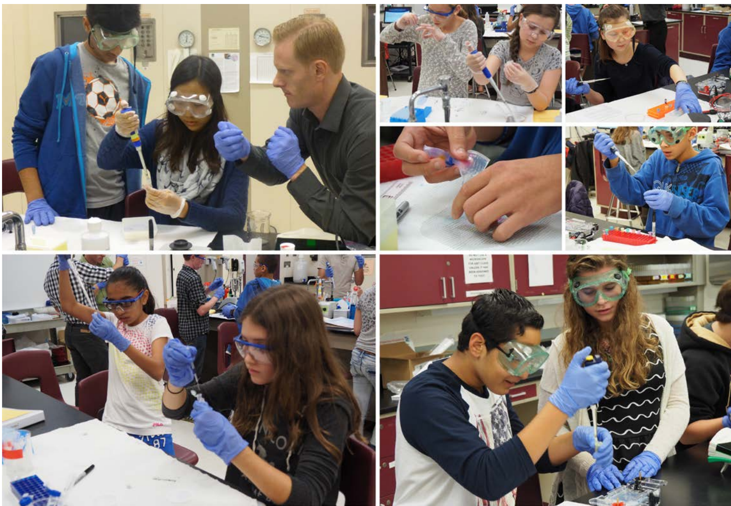
Using colored dyes, we learned how molecules can be separated by size and charge.