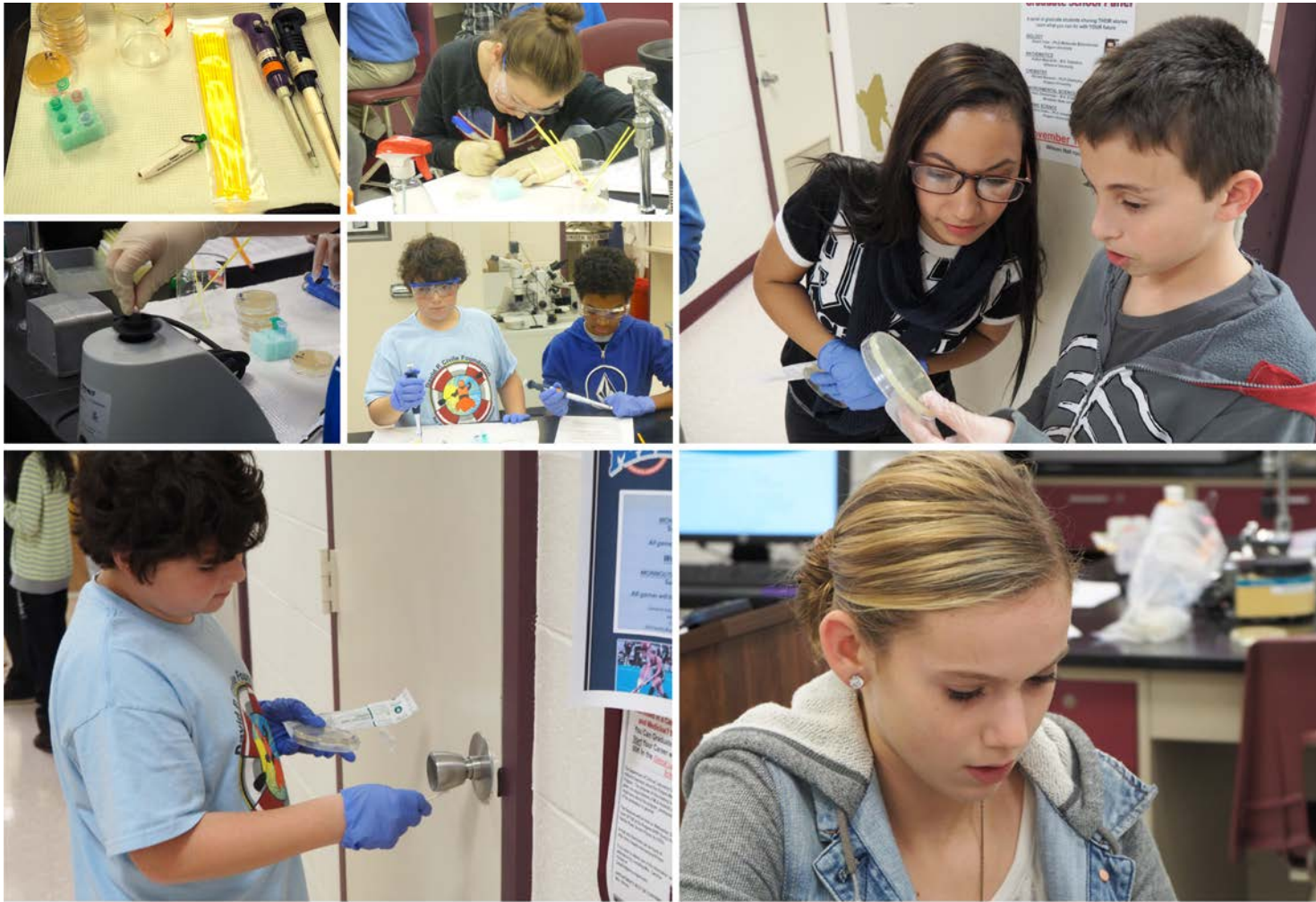
The next step on this voyage taught us how to work with bacteria! We swabbed various locations and worked with Petri dishes.