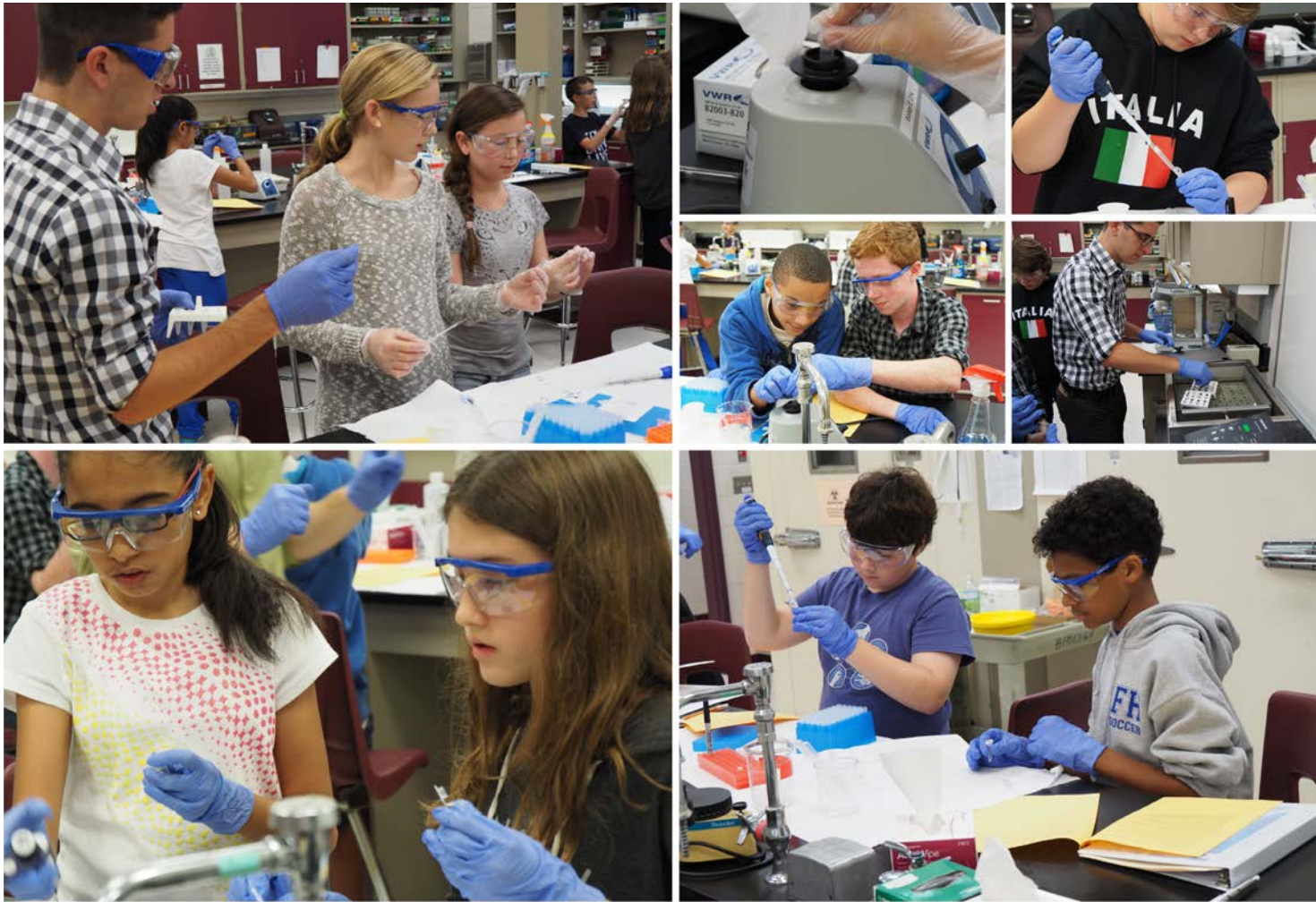
Science requires precise skill, which we practiced every week.