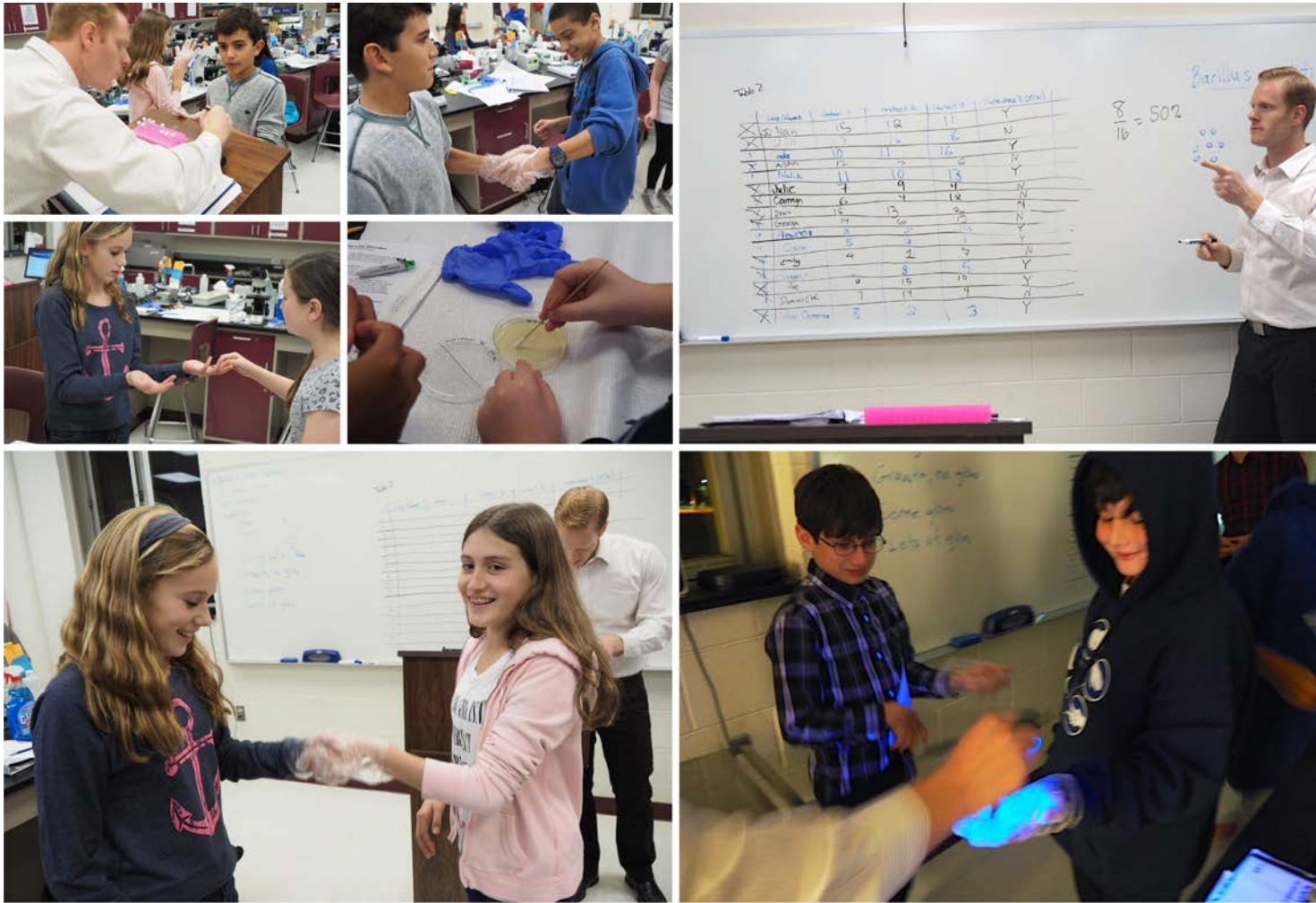
Our epidemiology tracked disease migration using hand shaking. That prompted our next experiment on investigating which method of hand cleaning was better – hand sanitizer or antibacterial soap?