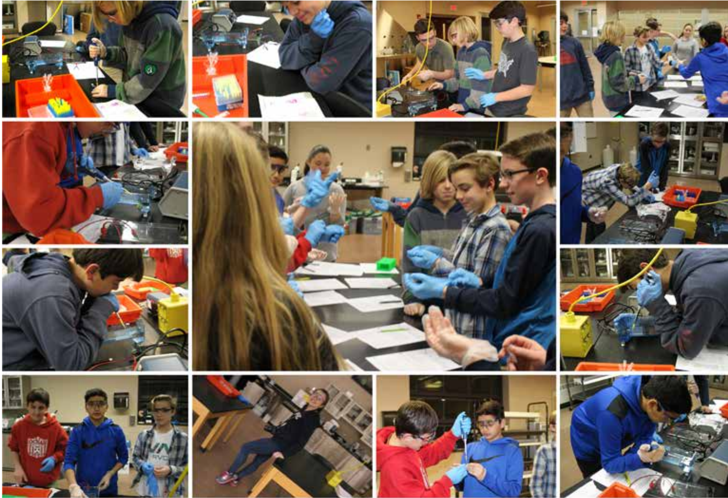
We ran our first gel electrophoresis. We successfully separated the colored dyes using an electric field to sort the dyes by charge and molecular weight. This group did a terrific job of learning to load their gels!