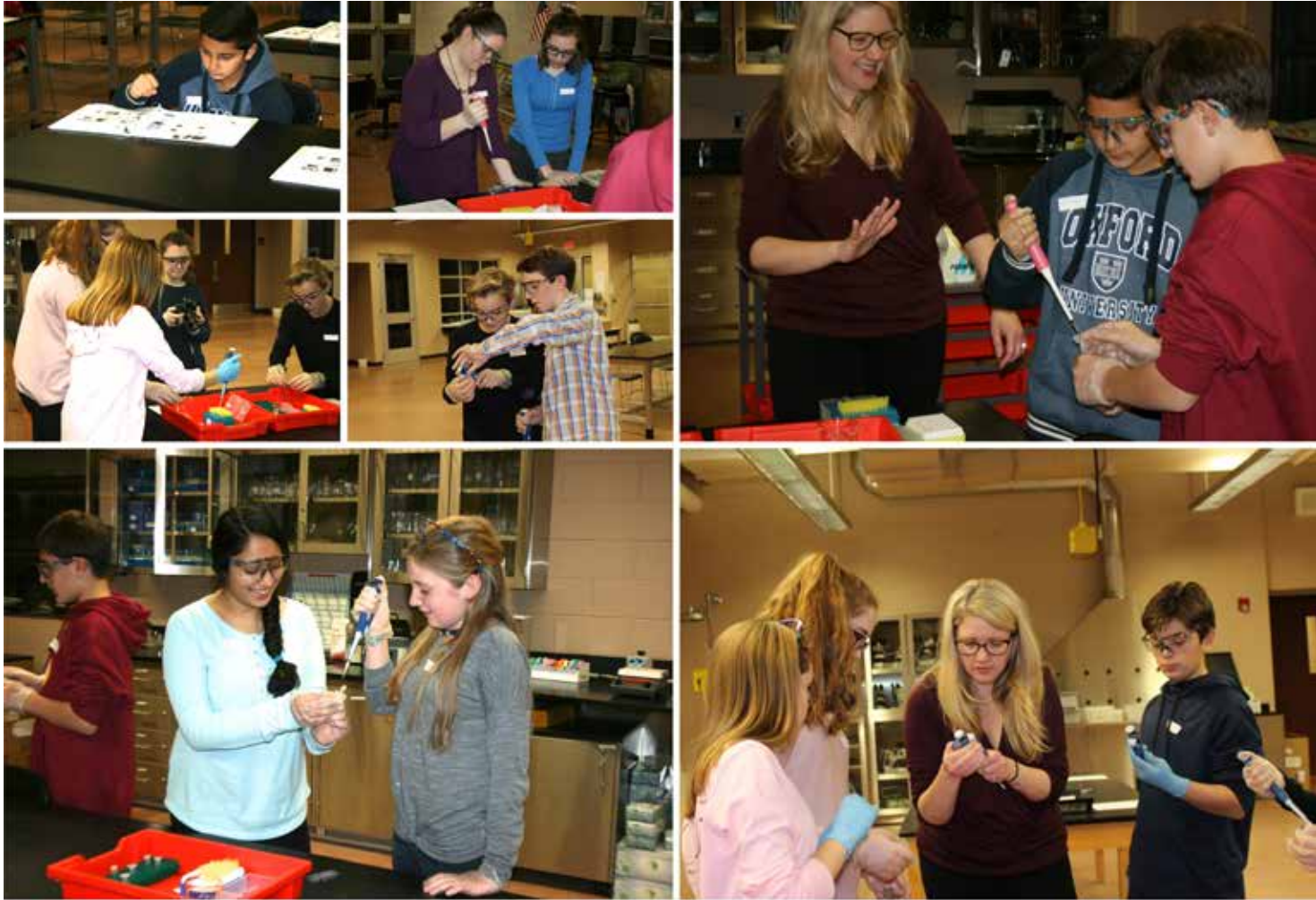
We started our journey learning about lab equipment and safety. We got to try micropipettes for the first time. These tools allow researchers to accurately transfer tiny amounts of a solution during experimentation.