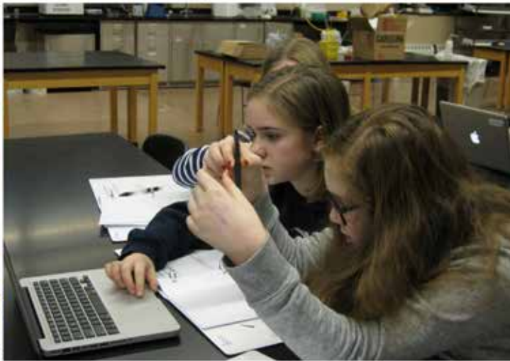
For our capstone project, students brought in a variety of plant-based grocery items from fruit to tortilla chips to test whether or not they contain Genetically Modified Organisms (GMO).