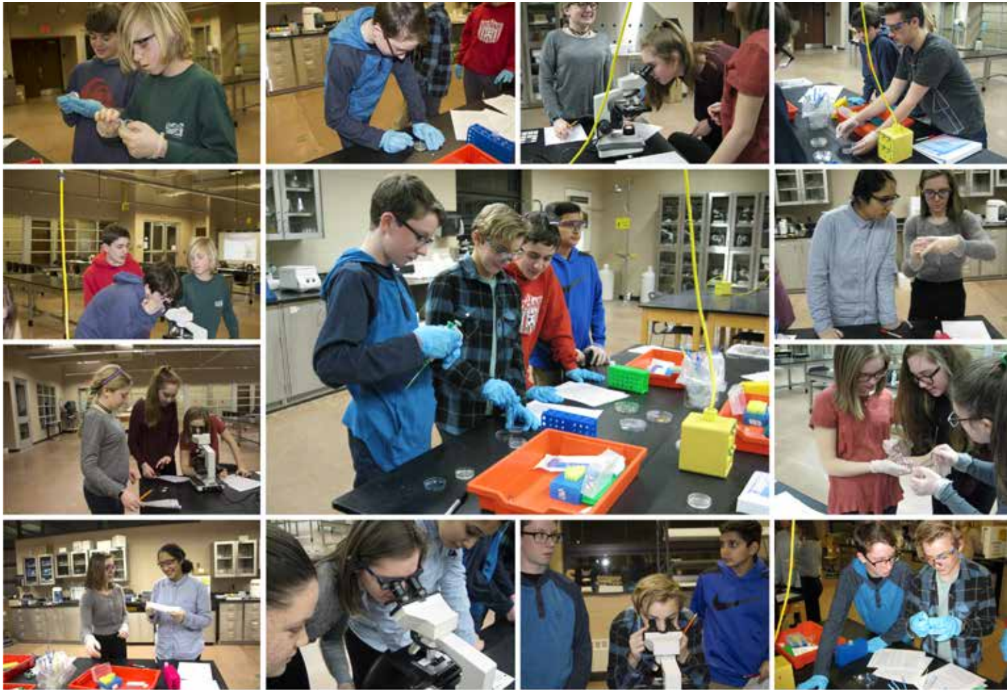
We moved on to exploring other microbes, and got to use compound microscopes to compare two strains of bacteria, E. coli and B. subtilis .