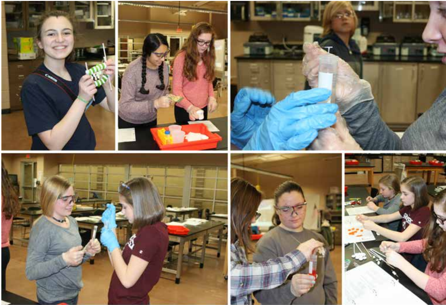
We learned about the structure of the DNA molecule and got to build a DNA Double Helix using candy, straws and peppermints!