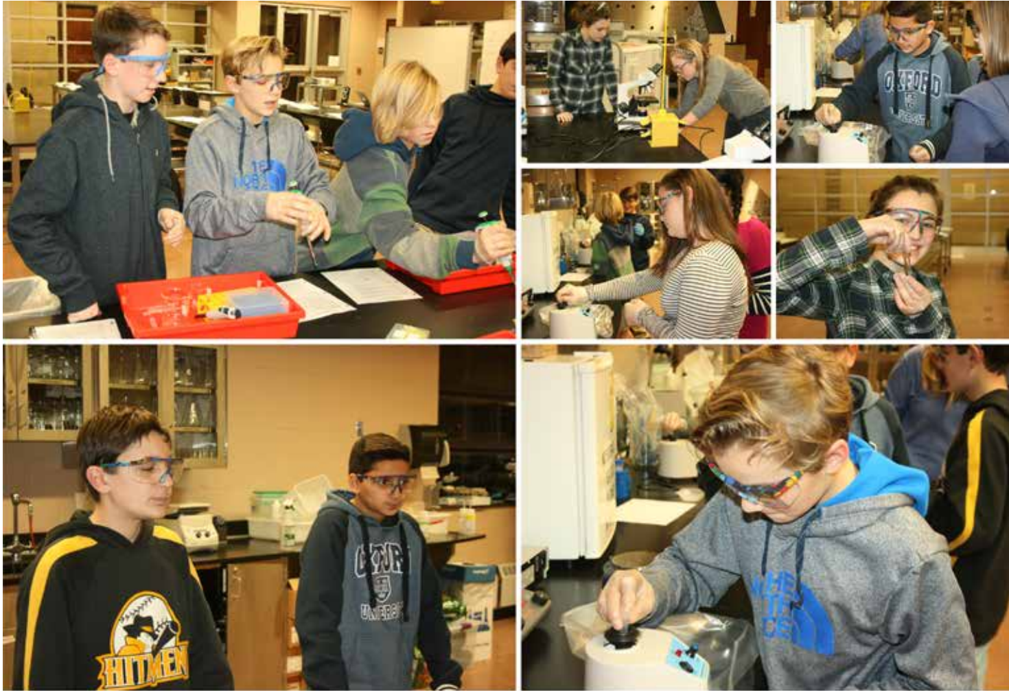
We are proud that EVERY student was successful at DNA extraction!