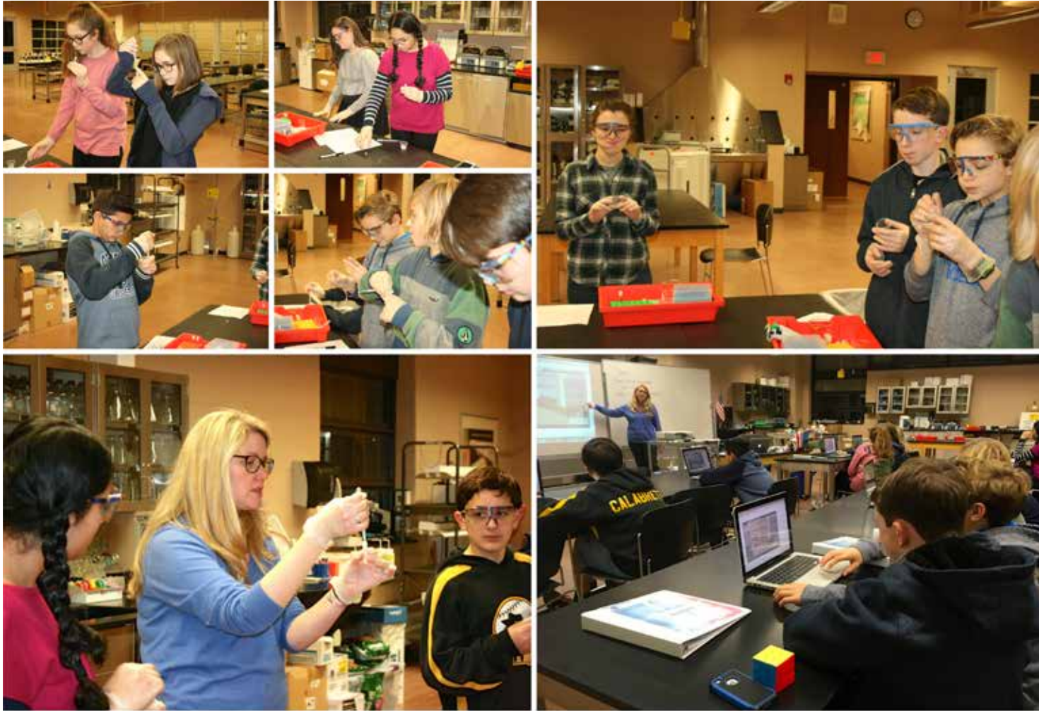
We had the chance to extract our own DNA using real laboratory equipment found in the Biotechnology lab, like microcentrifuges and micropipettes.