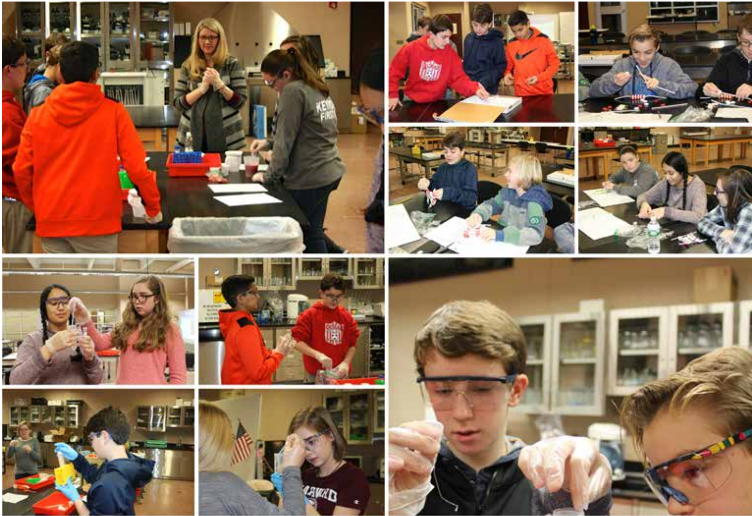
Though it was a little messy, we had fun extracting DNA from bananas and strawberries using common household items. We even compared which group extracted more DNA from their fruit.