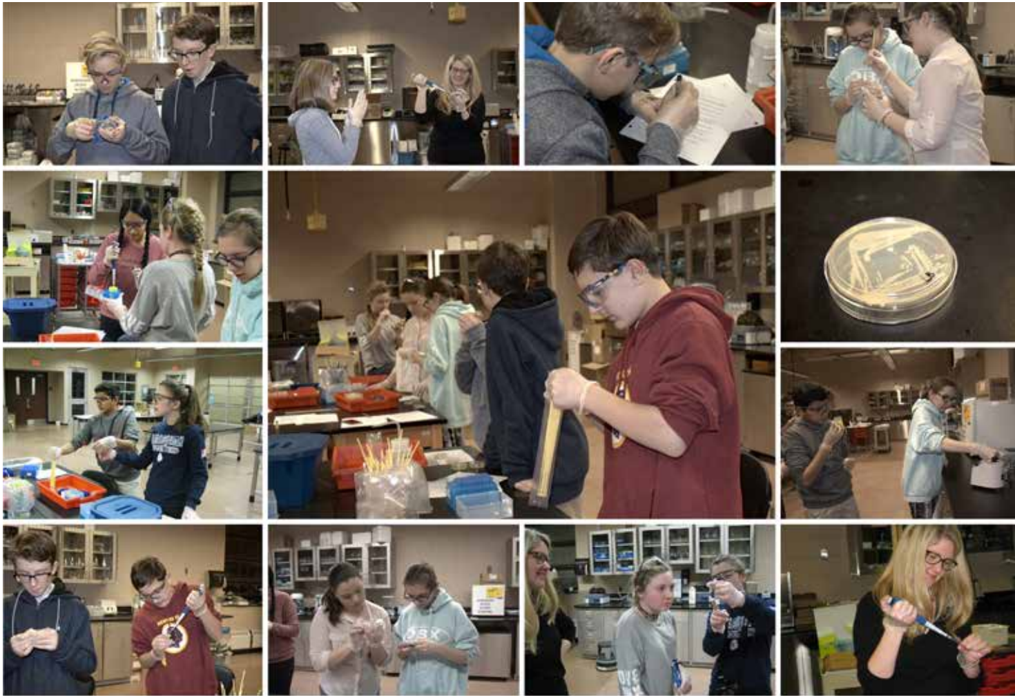
We learned to use sterile technique and basic microbiology to culture bacteria. Then we tested the ability of disinfectants to kill microbes. We loved using parafilm to seal our culture dishes.