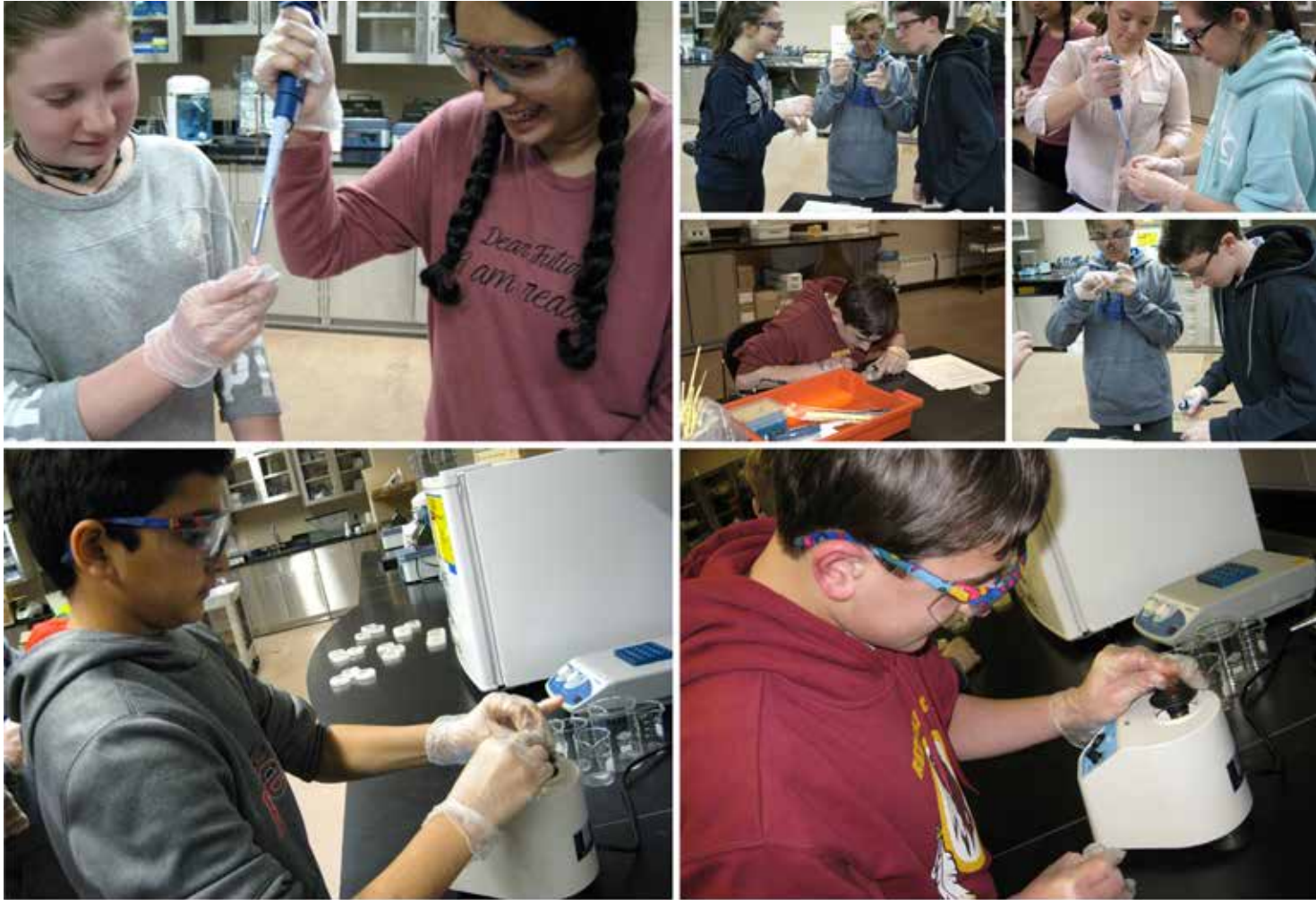
We put into practice many of the skills we have learned so far to follow the intricate steps involved in creating a Genetically Modified bacteria using a Recombinant DNA technique called Transformation.