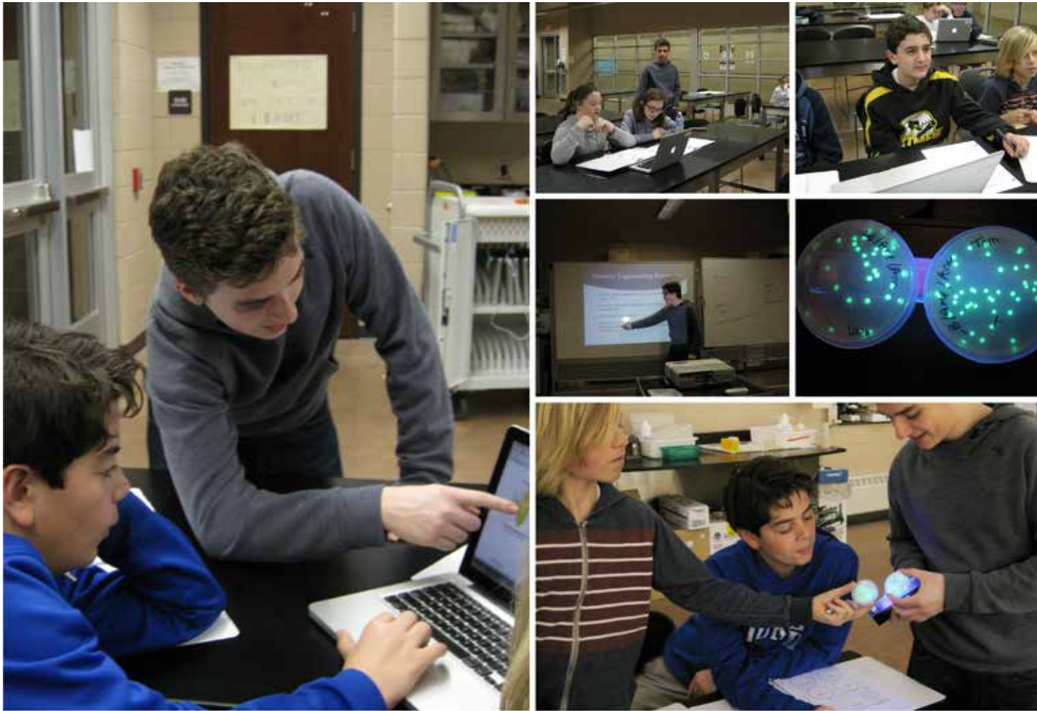
Our transformed bacteria are able to glow in the dark with the help of a piece of jellyfish DNA. Every group was successful in engineering their Glow-In-The-Dark bacteria! Great work!