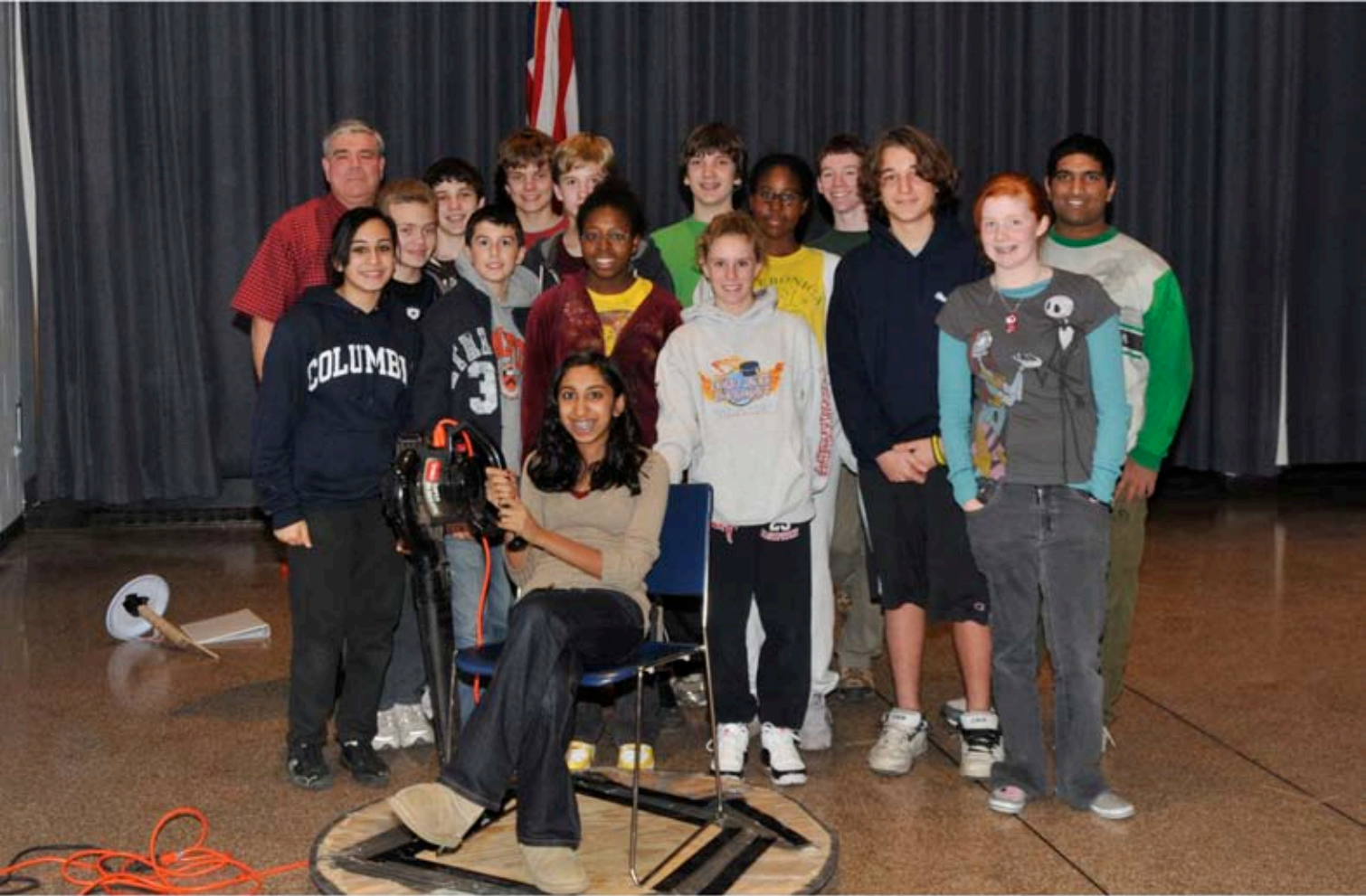
The "Stars" of the class Explore, Imagine, and Build