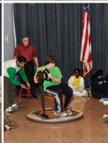
The whole class hovers for physics.